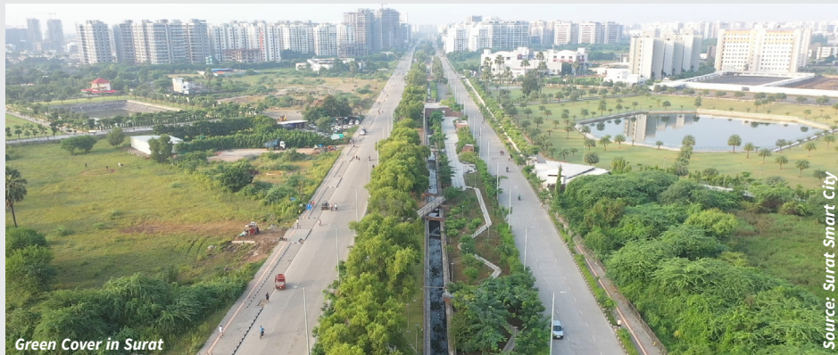
Green Cover in Surat